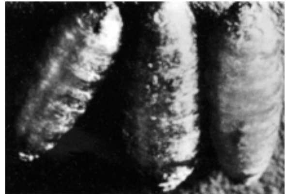
Cabbage maggot puparia.