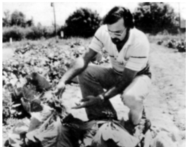
Cabbages treated with pesticides (left), garlic spray (center), and wood ashes (right).