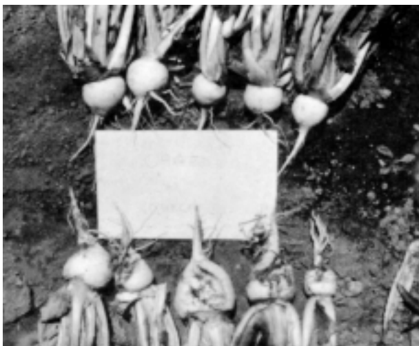
Cage-grown turnips (top) escape damage suffered by uncaged turnips (bottom).

Mature maggots leave the plant and change to pupae in the soil nearby. In two to four weeks the adult fly emerges. There are usually three broods or generations a year.