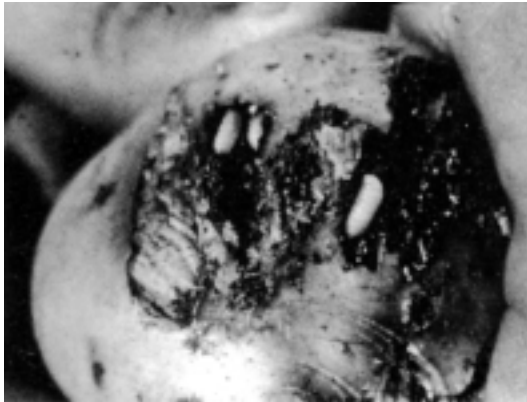
Cabbage maggots in turnip.

Cabbage maggots spend the winter in a resting stage called a puparium, an elongate brown structure with