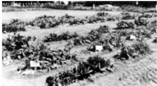
Nonchemical pest control methods were tested on experimental plots.

Precursors to floating row covers were tested by WSU in the 1970s. They proved to be excellent in preventing female flies from laying eggs at the base of plants. Place them on soil not previously infested and be sure a tight seal exists between the soil and the netting. Washington State University scientists tested other non-chemical techniques on experimental plots. Two popular treatments, use of garlic sprays or wood ashes, had little value (see photos).