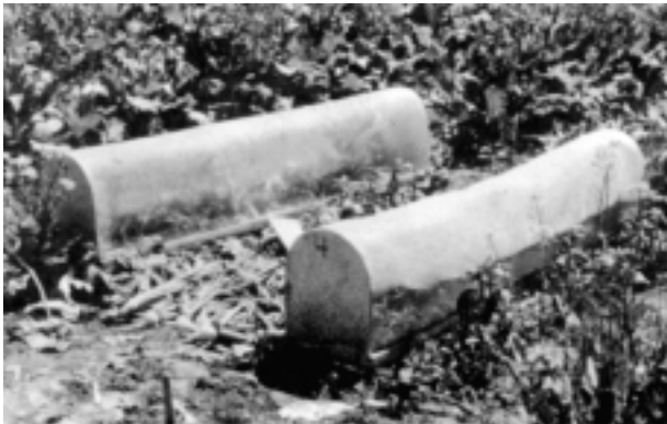
Screen cages keep female cabbage maggot flies from laying eggs near base of plants.

Maggots hatch from the eggs in three to seven days, then migrate through the soil and feed on underground plant parts. The maggots are cream to white in color and about 10 mm or \frac{3}{8} inch long when mature. The insect causes damage only during the maggot stage, which lasts from three to five weeks.