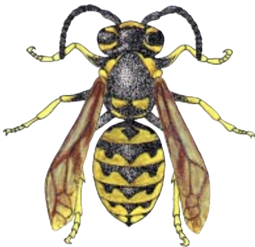
Typical western yellowjacket worker.