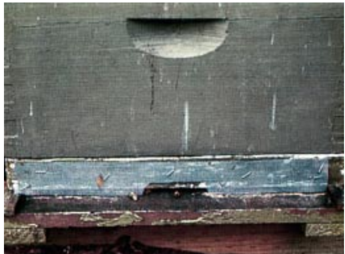
Dilly anti-yellowjacket screen.